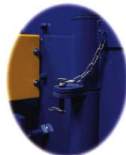
SECURE MANUAL DOOR IN OPEN POSITION.