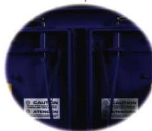
DOOR CLOSED WITH LIMIT SWITCH ACTIVATED.